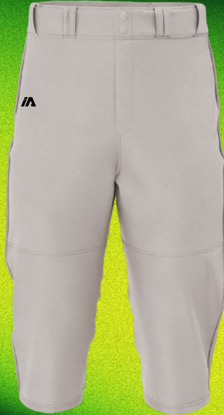
KNEE HIGH MENS AND WOMENS