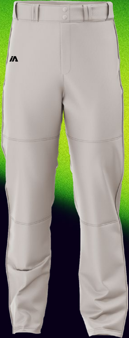
LONG PANTS RELAXED FIT MENS