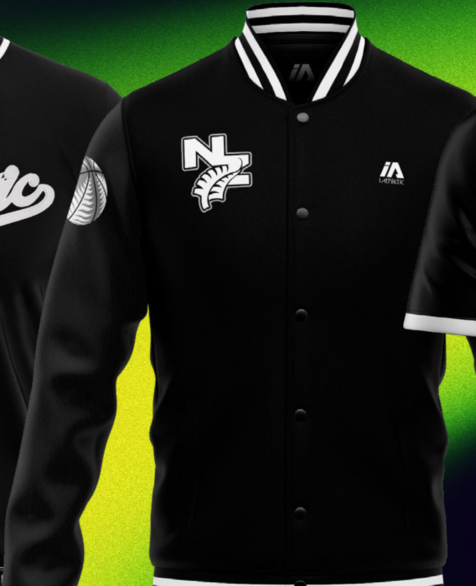
LETTERMAN JACKET TACKLE TWILL AND EMBROIDERY