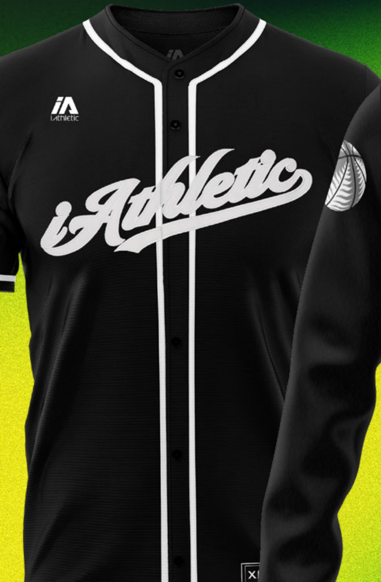
BASEBALL JERSEY EMBROIDERY